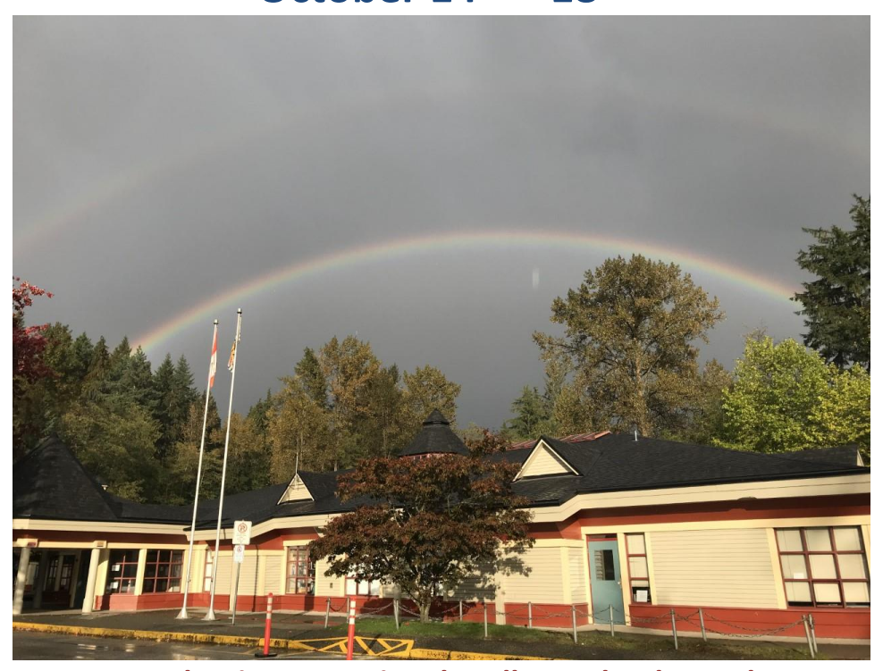
October is International Walk to School Month http://www.sd44.ca/school/covecliff/Pages/default .aspx Follow us on Twitter @cove_cliff